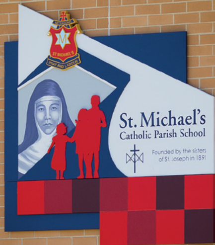
size: 2000mm x 1960mm $7,000 - $9,000 +GST