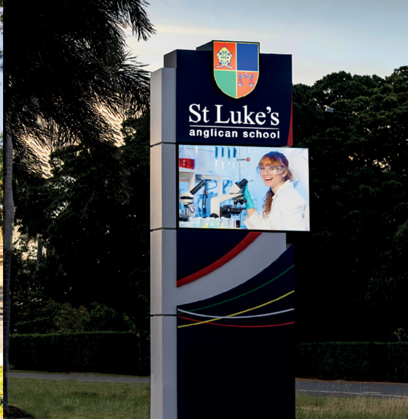
size: 1800mm x 4680mm $40,000 - $50,000 +GST (double-sided, internal lighting)