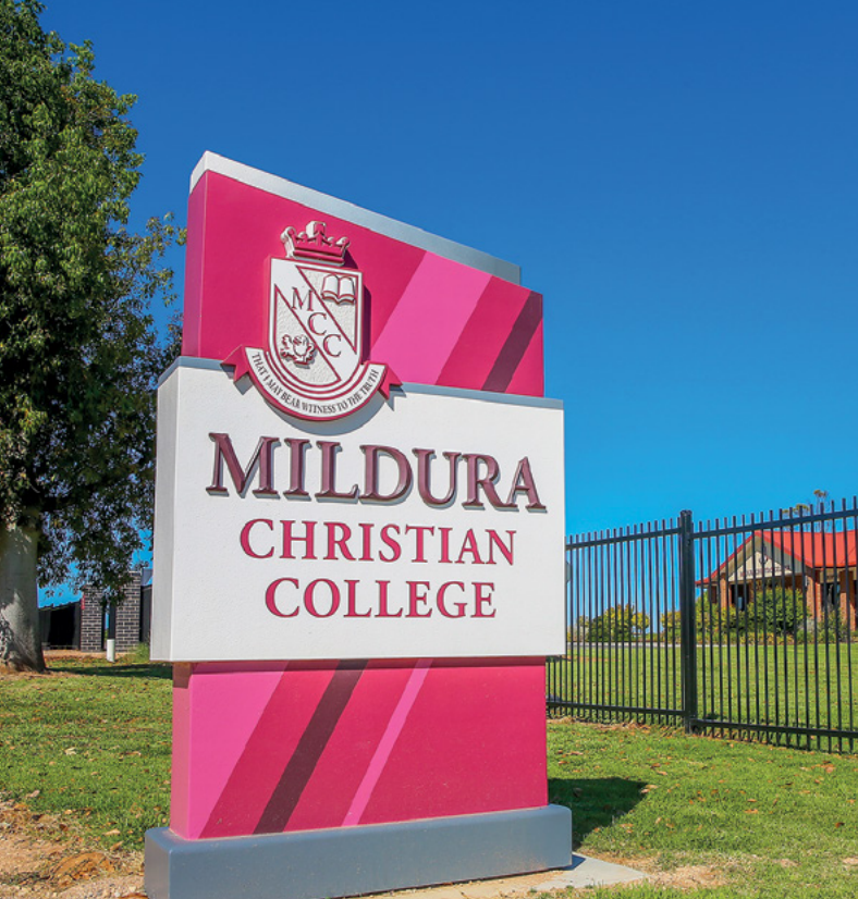
size: 1110mm x 2250mm $4,500 - $6,600 +GST (single-sided)