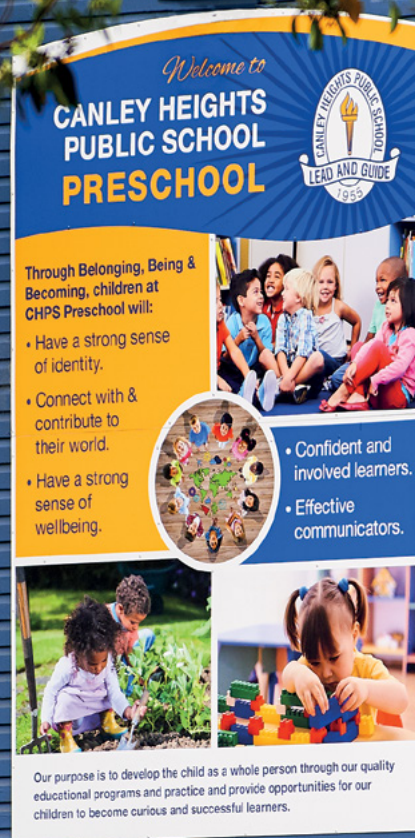
size: 2030mm x 3000mm $4,000 - $5,000 +GST