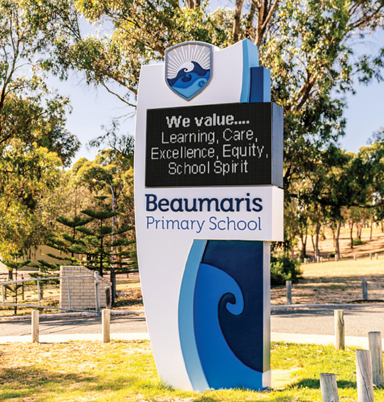
size: 1780mm x 4285mm $33,000 - $40,000 +GST (double-sided)