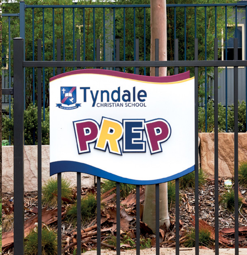
size: 1000mm x 800mm $1,500 - $3,000 +GST