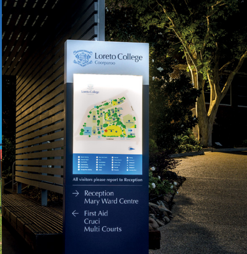
size: 800mm x 2300mm $4,500 - $6,000 +GST (single-sided, internal lighting)

Additional map design fees apply. Ring us for a quote.