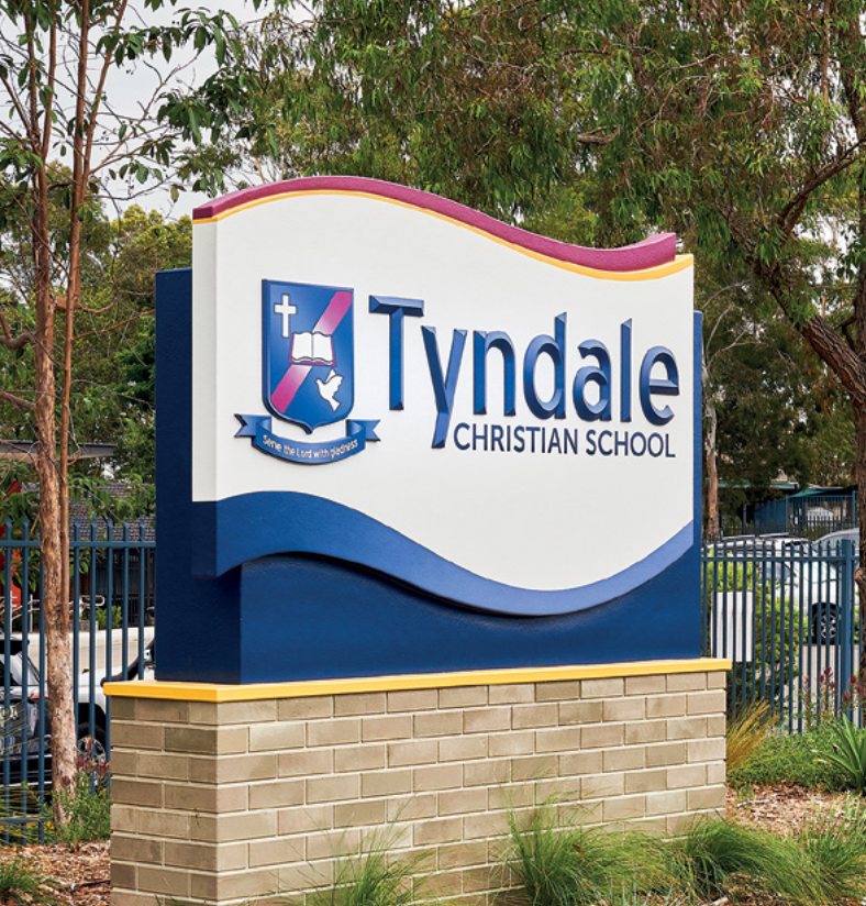
size: 2490mm x 2305mm $15,000 - $18,000 +GST (single-sided)